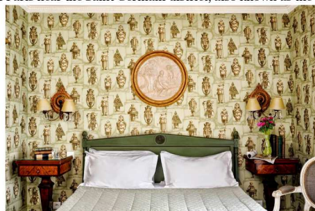
view of the fashionable room I stayed in

Left Bank of Paris near the Saint Germain district, also known as the Latin Quarter.